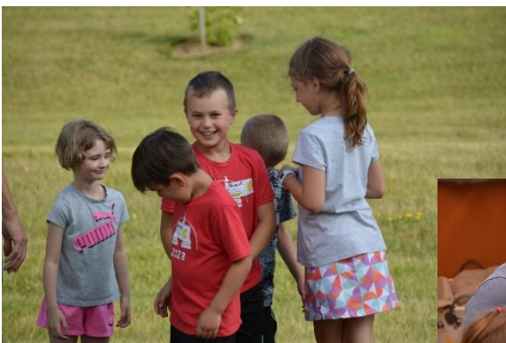
Preschool Kids at Congregational Events!