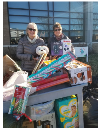
Delivering Giving Tree items to LCFS